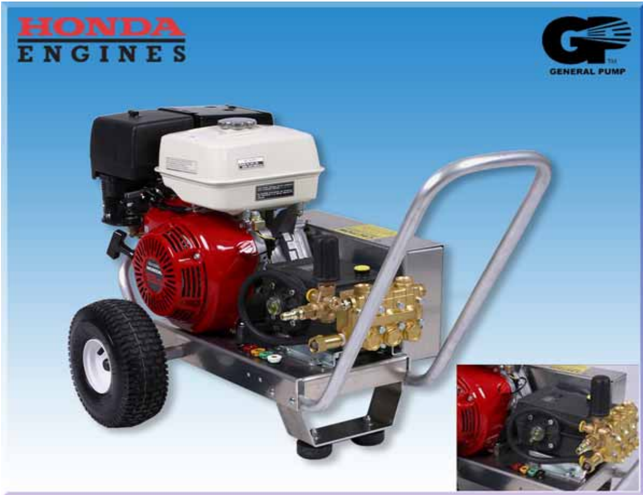
EZ-View Sight Glass