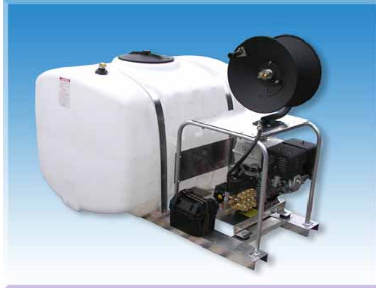
AST200, ASR100, KBP100, AHR200-1, KTD075, LWS100, TS/D4040HGE331

Pro-Skid units can be combined with various cold water pressure washer skid units to achieve a "Totally Self Contained" 50, 100, or 200 gallon tank feed system. Available pressures of 2400 PSI to 5000 PSI and up to 5.5 GPM in belt, gear and direct drive configurations. Add the model with those features and options below to design a custom built Honda powered unit built to your specifications. All skids are constructed of Aircraft grade aluminum which are chemically resistant and rustproof. All units feature adjustable pressure unloader valve and engine oil drain kit. These portable units mount quickly and securely into truck beds, trailers or other vehicles.