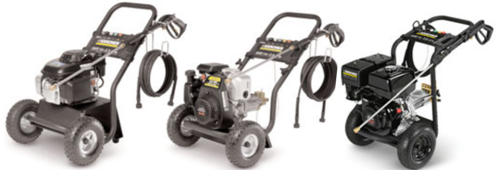
Model HD 2.3/26 CV: 21"L x 23"W x 31"H

the home. All three models feature precision-welded steel frames with removable handles, reliable Honda engines, Kärcher axial pumps and tubed pneumatic tires for all-terrain maneuvering. All come with an ergonomically designed, two-piece gun and wand assembly with pro-style, quick-disconnect high-pressure nozzles for varying the fan spray. Each has a bracket for cradling the gun, wand and 25 or 50 ft. of hose.